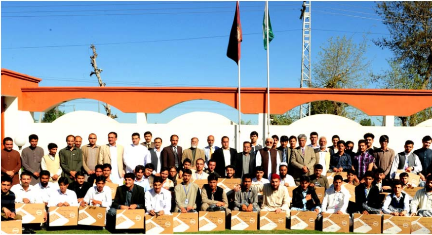
A glimpse of equipping new generation with the latest technology at Riffat Mahal Campus